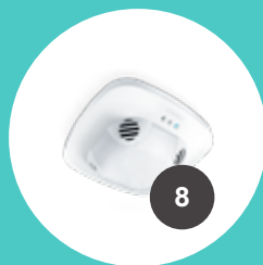
Ultra Sonic Sensors Commercial