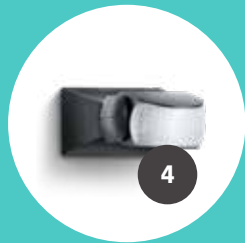
Infrared Detectors Residential