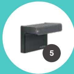
HF Motion Detectors Residential