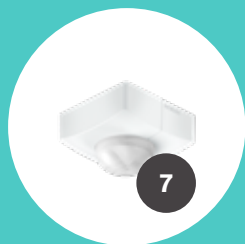
Infrared Detectors Commercial