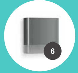
Digitally Controller Residential